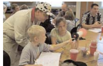
Graduate students in the Advanced Teaching of Elementary Science course show kids how fun science can be at the 2005 Summer Kids Inquiry Program (SKIPS).

The Southwestern Bell Science Education Center offers a state-approved alternative certificate program for graduate students to learn advanced methods in science teaching. The graduate programs in science education prepares its students for everything from classroom teaching to leadership positions at all levels of education. SBSEC offers science education curriculum for master's, doctoral and educational specialist degrees. The programs of study are individually planned with a faculty committee, and are based on the candidate's background, experiences and professional goals.